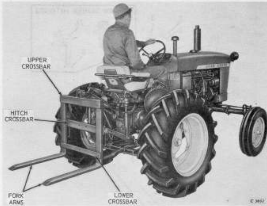
John Deere 26 Fork Lift Mounted on John Deere 1010 Tractor Manufactured (1952- )

NOTE: The 26 Fork Lift was originally described as the TP26 Fork Lift.