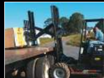
The CR 50 PALREACH unit will reach 45" across the bed