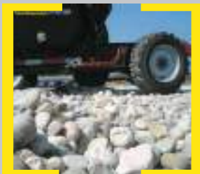
No counterweights on tires.