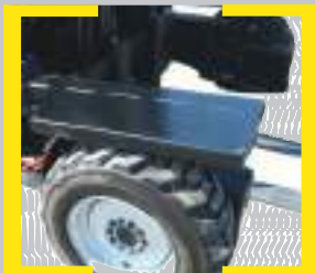
Hydraulic lumber support arm package.