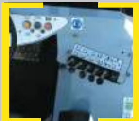
4-way mode enabled via hydraulic lever.