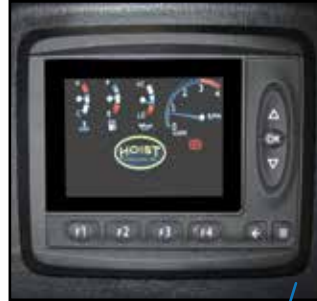
MD3 display provides operator filter restriction alerts.