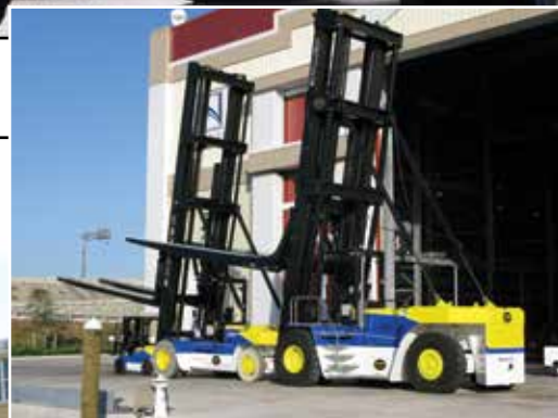
capacity - 55,000 lbs. & 25,000 lbs.

The low-profile counterweight provides excellent rear visibility & increased maneuverability