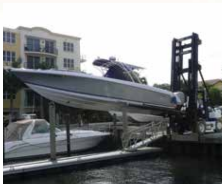
capacity - 20,000 lbs.