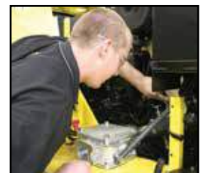
Issue(s) addressed by service tech