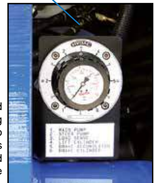
Hydraulic pressure can be easily read by lifting up a flip-open step and twisting gauge. This eliminates downtime due to hydraulic system issues and eliminates the need to tap into hydraulic lines and potentially contaminate the marine environment.