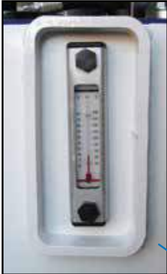
Hydraulic oil level temperature gauge is located on the side of the liftruck for easy viewing.

Hoist values our customers and understands the importance of maintaining relationships beyond the point of sale and is dedicated to providing quick parts support and satisfying service. The Neptune Series is designed to allow easy access to all integral components for maintenance and repair. Every component on a Hoist liftruck is sourced from the United States, with more than 75% of the components manufactured by Hoist. Over $5 million in parts inventory is maintained in stock, allowing Hoist to provide the quickest replacement part lead times in the industry and provide excellent 24/7 parts/service support.