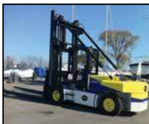
Issue(s) detected by RemoteTech