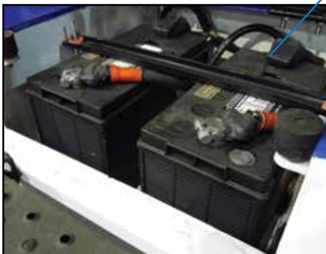
Located on both sides of the forklift, flip-open panels allow quick and easy access to the complete drive line, batteries and hydraulic multi-gauge.