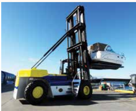
capacity - 55,000 lbs.