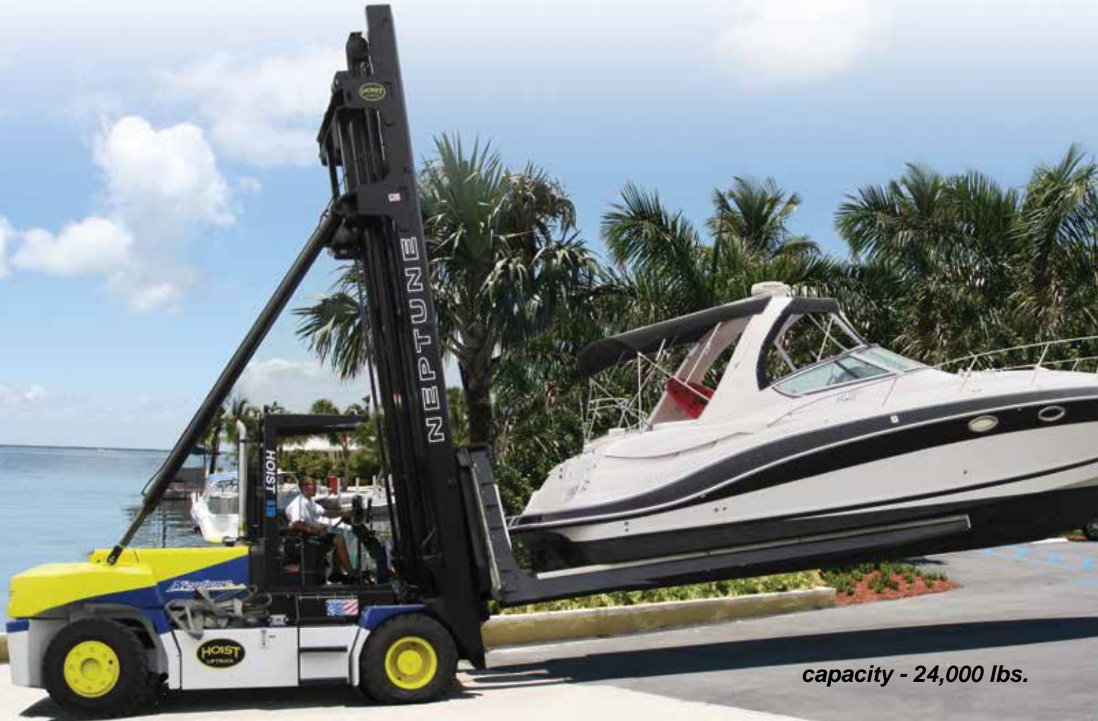
capacity - 24,000 lbs.

The Neptune Series offers premium STANDARD features ideal for your marina and boat handling needs. These standard features include galvanization, powder coating, and a three-step paint process for maximum corrosion protection; advanced rubber fork covering system, intuitive electronic joystick controls, luxury air-ride seat, tier-compliant Cummins diesel engine, algae filtration system, and RemoteTech vehicle management system.