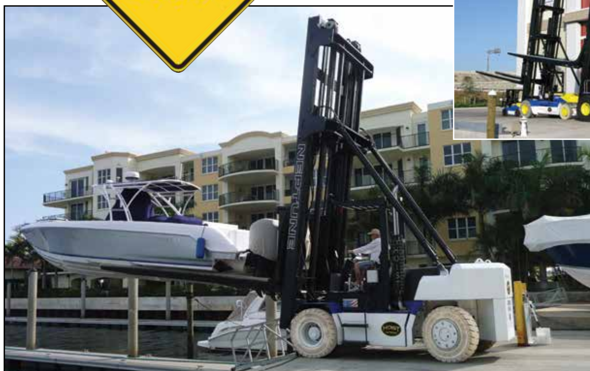
capacity - 20,000 lbs.