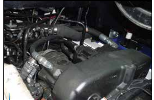
Daily checks and routine maintenance are simple with easy-lift hood, which is supported by a gas cylinder. Once opened, fluid, filter and other service points are immediately within reach.